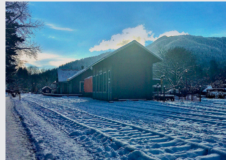
Experience Historically Hip Downtown Issaquah